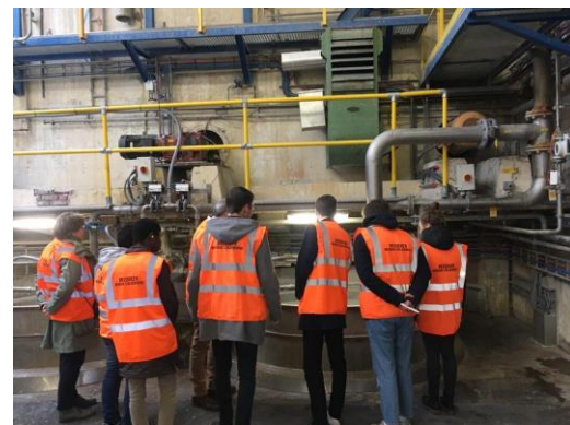
Excursion paper mill Neenah Coldenhove, Eerbeek