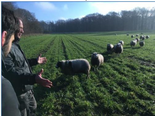
Excursion circular agriculture, Velhorst Lochem

Final assessments take place in the last week.