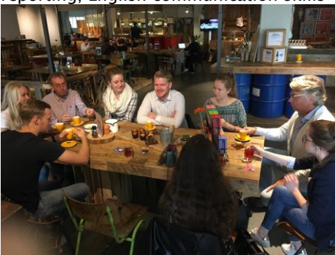
Excursion break at Waste Factory, Veghel

In this minor you will work on various skills in an international setting, such as gaining economic, environmental and social insights, business development and marketing, human relations management, analytical approach and systematic thinking, cooperating in a heterogeneous group of people, research and reporting, English communication skills