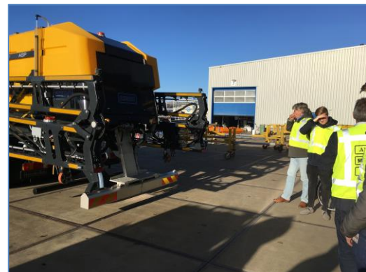
Excursion Aebi Schmidt, Holten