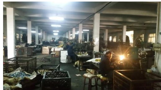
Factory in China

'If you want to learn about sustainability this minor is of good quality, thanks to the classes in Q1 and the guest lectures in Q2. The project gives a good insight in sustainability.'