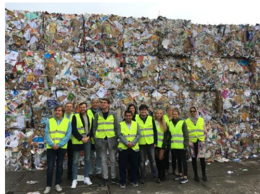
Excursion Van Gerrevink, Apeldoorn