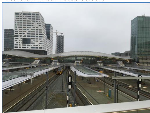
Excursion Central Station, Utrecht